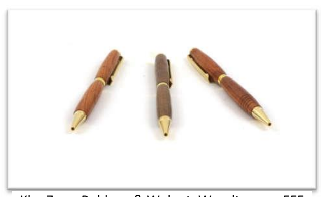
Kim Zorn, Bubinga & Walnut, Woodturners EEE