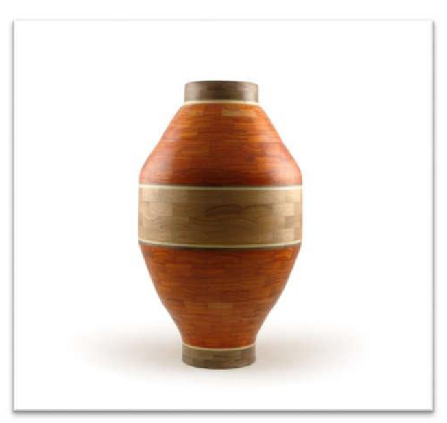
Terry Moore, Padauk/Mahogany/Walnut/Maple, 19"