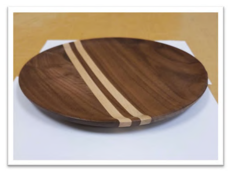
Ned Robertson, Walnut & Maple, Tung Oil & Buffing System