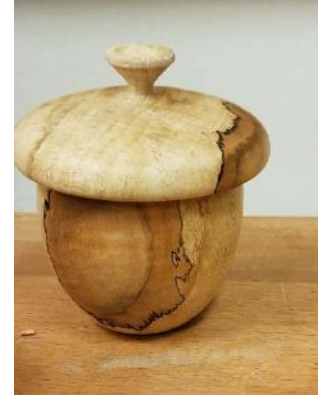
Tenon on Box, Cover wraps around box