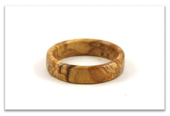
Chuck Horton, Spalted Bradford Pear, Wipe on Poly, 3¼"