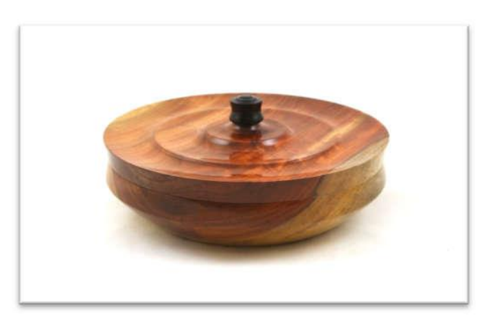
Robert Gundel, Camphor, Buffed & Waxed, 8" X 21/2"