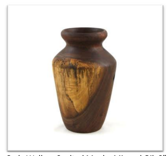
Cody Walker, Spalted Maple, Mineral Oil, 8"