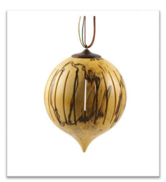
Jim Bumpas, Spalted Maple, Waterlox, 3", Ornament