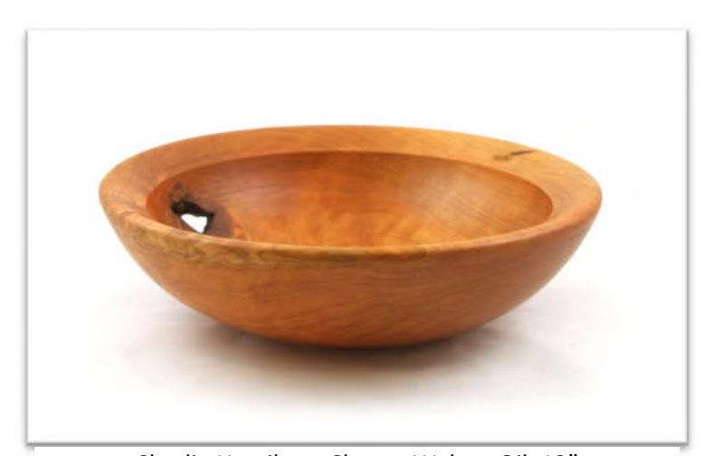
Charlie Hamilton, Cherry, Walnut Oil, 12"