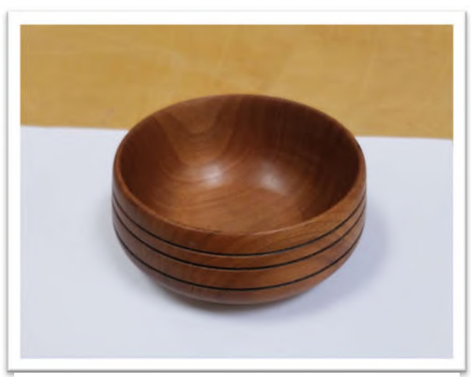
Meg Turner, Cherry(?), 4"