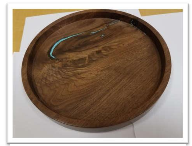
Ned Robertson, Walnut and Turquoise, Tung Oil & Buffing System