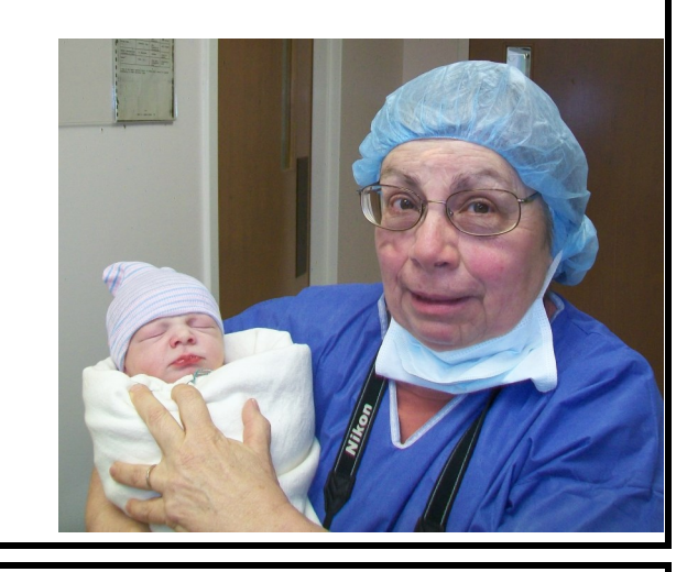
MARCH, 4th Thursday (Not the 3rd)