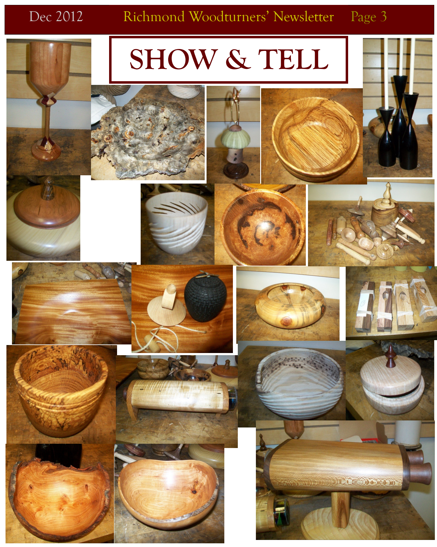
Things : Lidded bowl, bird house, bowls, natural edge bowl, candlestick, square platter, tops, scoops, goblets, Sid's Kaleidoscope that got left in Ray's office last month, Wood: Maple, buckeye burl, sea urchin shell, walnut, spalted oak, cherry, Norfolk Island pine, Cuban mahogany, red oak, white oak, popular, mulberry, hackberry