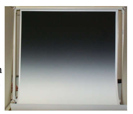
Light Box: PVC with hanging white paper.

shaking or background movement. Background: keep it simple, gradient paper, velvet; hold small objects steady with sandbags (under the background) or museum wax. Ray show us the benefits of a good Photoshop program. His was the high dollar version, but his use of masking tools to find areas to change can be on lower $$ versions. Want more information: www.dpreview.com check out the articles on photo or software techniques or basics.