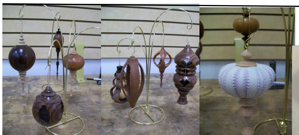
Don't drill the hole too deep. Time for a design change Mike.

Wood: Walnut, marbleizing, holly, quilted maple, pecan, found wood, cherry, cocobolo, lignum vitae, red heart