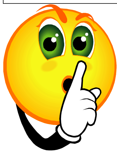
Take the excess talking out