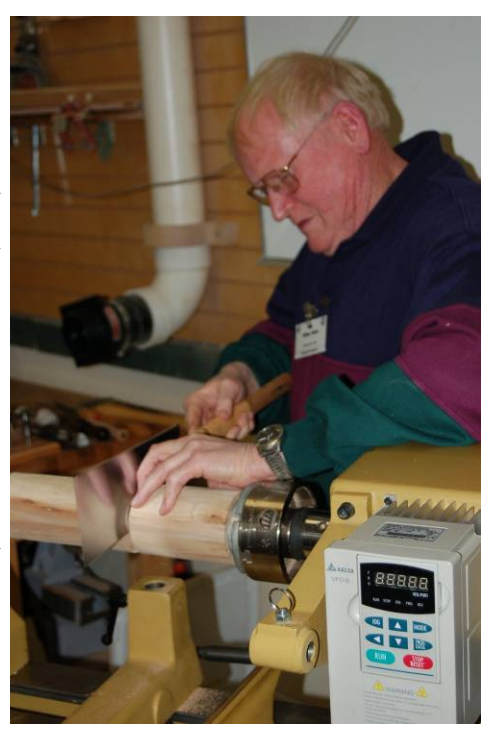
Turn it round then separate the top from the bottom