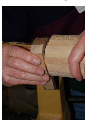
Fit the parts together for final

Make a turning blank 3.5 "square by 12+ inches. This can be a solid block, glued up end grain squares, glued up 3/4 inch wood or anything else you wish to try. Only thing necessary is good glue contact to all wood surfaces. (Ray sells the pepper mill grinder parts) Get the 10 inch one which can be cut down if necessary. Turn a 2+ inch tenon on each end for reverse chucking later. Many Forstner bits (2 -3/4 inch) were used as was a drill bit extension. Drill out the bottom to about 4 inches deep. Use a drill diameters suggested by your grinder mill instructions. Mark the blank half way up from the bottom. Cut into it with a parting tool. Make a tenon on the head stock end. Finish cutting off the bottom with a thin blade saw. Size the tenon to 2 inches in diameter but only deep enough (3/8" or less) to get a good hold on it with a 4-jaw chuck; flatten the end then drill it out with a 3/4 inch drill to about 1.5 inches deep (Diameter for the top part of mill to be attached). Don't drill all the way through the top blank (Drilled later from the other end to make sure it's centered). Chuck up the bottom piece and true up